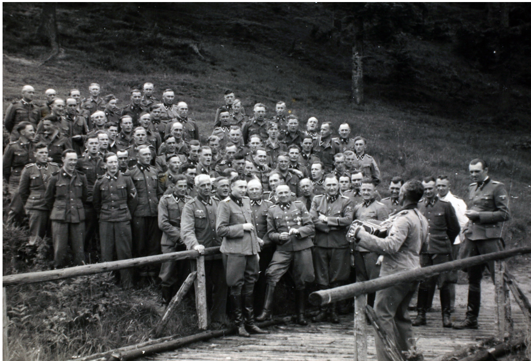
The staff of the Auschwitz complex posing on the bridge in front of the Solahütte, 15 July 1944. The photo shows a team-building day just after the murder of 320,000 Hungarian Jews, called Aktion Höss. 94