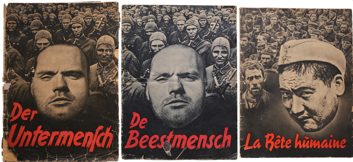
Three-language versions of the SS magazine Der Untermensch , published by the Reichsführer-SS in 1942. The publication extremely positioned the Untermensch (Jews/Soviets) against the Übermensch (Aryans) and was widely distributed in Nazi Germany and occupied countries. 66