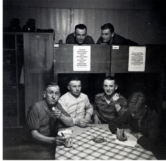
Two photos from a personal album showing the simple and tidy quarters of the guards at the Neuengamme concentration camp, 1941. 89