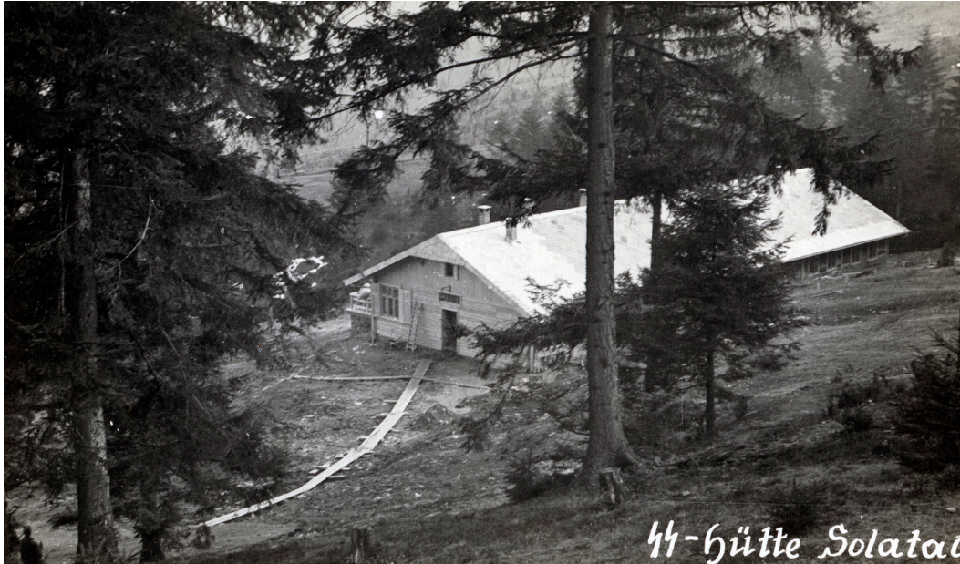
A postcard of the SS-Hütte Solatal, still in construction, near the Auschwitz camp complex, 1941. The postcard was sent by a SS-Mann from the second company of the SS-Totenkopf battalion. These postcards were made by the Erkennungsdienst in Auschwitz 1 and sold to the soldiers. 93